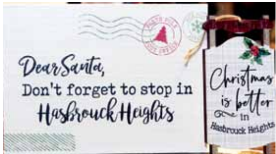
Available for Hasbrouck Heights, Wood-Ridge & Lodi