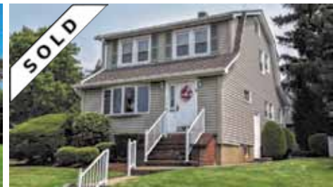
474 Collins Ave, Hasbrouck Heights Listed: $529,000 Sold: $505,000 Listed by: Joan Sentipal