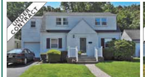
172 Washington Ave, Elmwood Park Center hall colonial $530,000